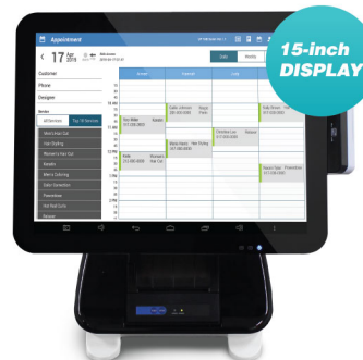
UP TAB™ 8050

UP TAB™ Salon Android™-based POS solution