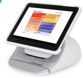
UP TAB™ AIO